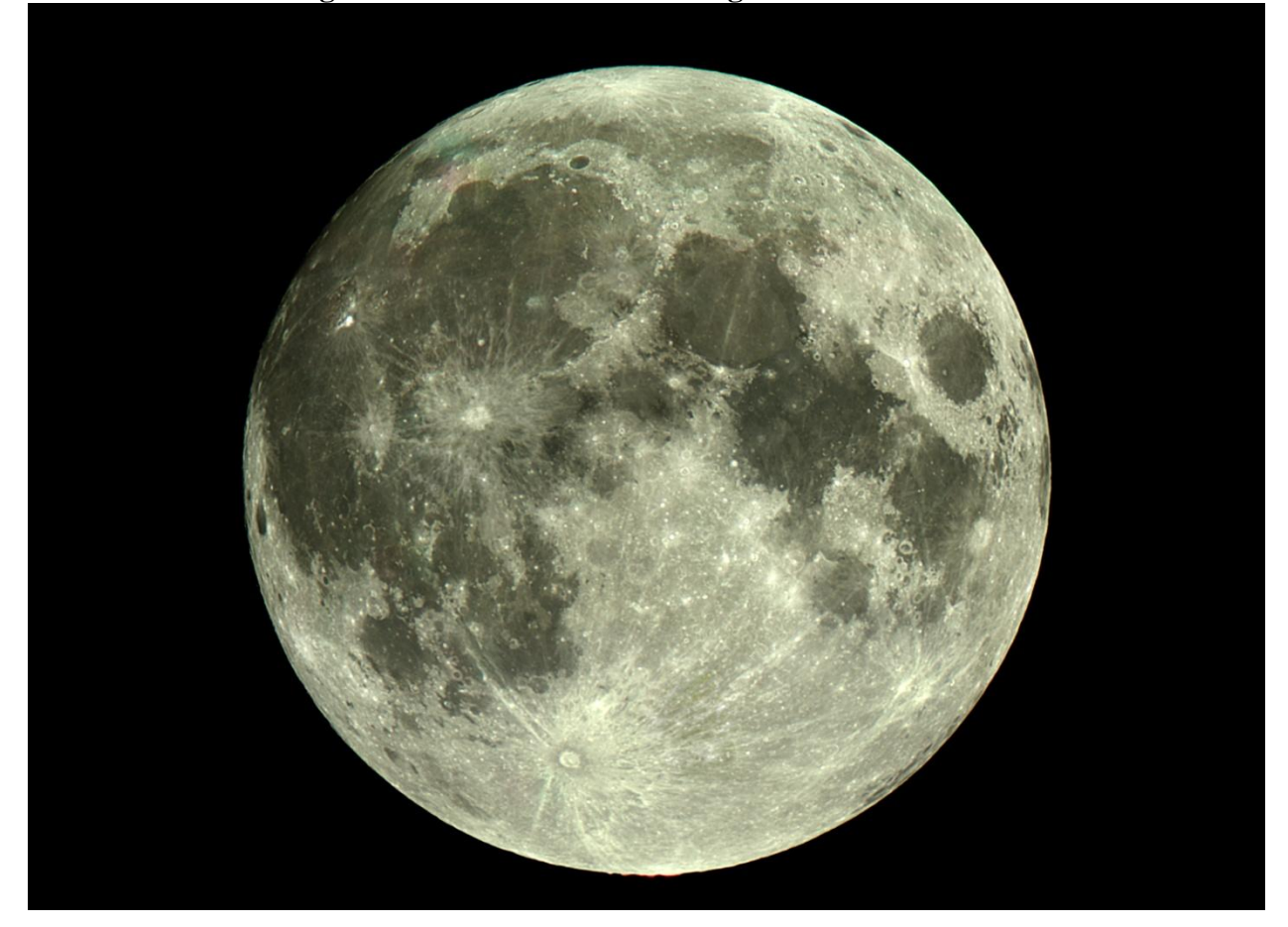
Figure 2 - The Full Moon Through 90mm Refractor

results and I am thrilled with how little effort it required. Stitching the panels together was almost as much work as the rest of it and I've gotten a lot of practice doing that at the color lab so I've gotten pretty fast.