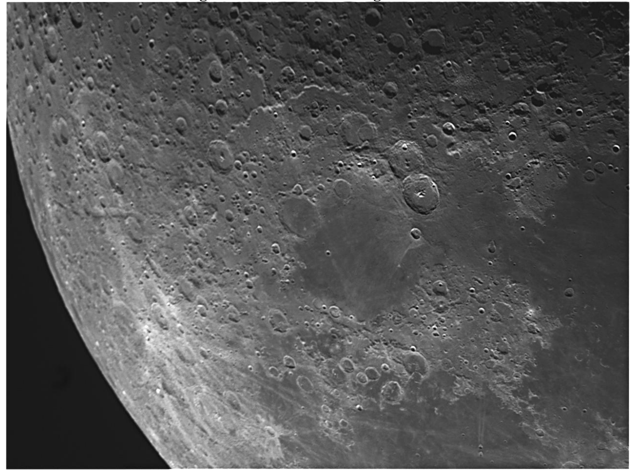
Figure 1 - The Moon Through 8" SCT

First up is a close up of the moon taken through my 8 inch SCT, shown in Figure 1 . This is an RGB image based on 3 minutes of video taken using default settings in the capture software provided with the camera (more on the software later). After collecting all three data sets I imported them to Registax 5, the last version made available, and processed according to the introductory tutorial provided by the authors of Registax. I haven't used Registax in a very long time and the interfaces are completely different, so I took the default values for everything I could until I got to the wavelets section, where I applied a very mild value of 5 for each wavelet. After that it was off to Photoshop CS3 to RGB merge the data sets and then balance the colors. That's pretty much all I did for all of the images you'll see in this article. I kept the processing to a minimum to show the quality of the data provided by the camera.